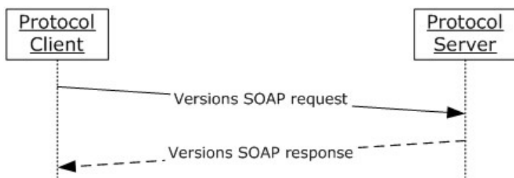
Figure 1: Versions SOAP sequence

The protocol client sends a request to the protocol server via a SOAP request message, and the protocol server sends return values to the protocol client via a SOAP response message, as shown in the following figure. All SOAP requests are made to one of several well-defined URLs on the protocol server, which protocol clients can discover. The protocol server never initiates any communication with the protocol client.