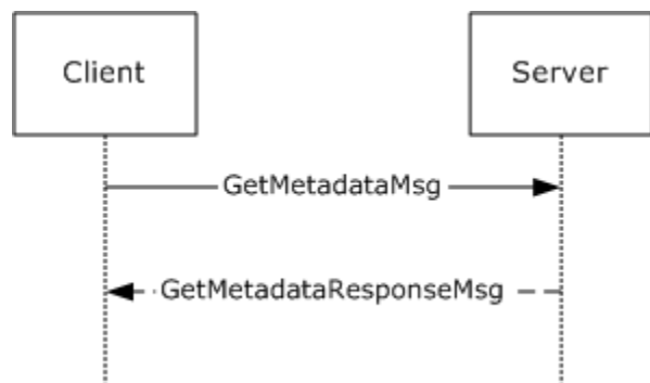
Figure 1: Message pattern of the User Profile Synchronization (UPS): Schema Exchange Protocol Profile

As an example of how the protocol server accepts a request message sent by a protocol client, as described in [WS-MetaDataExchange] , and the protocol server then returns a response message see section 4. The following figure, Message Pattern of the User Profile Synchronization (UPS): Schema Exchange Protocol Profile, illustrates this behavior.