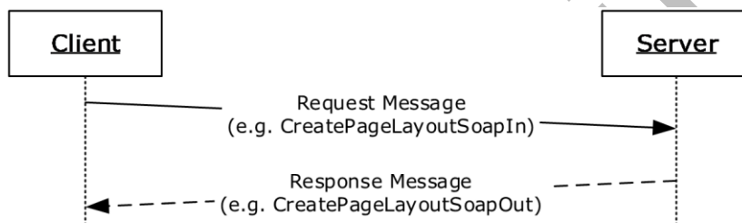
Figure 2: Sequence diagram showing the typical message pattern

The following high-level sequence diagram specifies the operation of the protocol. All operations consist of a basic request-response pair, and the protocol server treats each request as an independent transaction that is unrelated to any previous request.