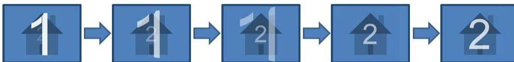
Figure 21: Sample window transition

The following is a sample with dir equal to "vert" (vertical):