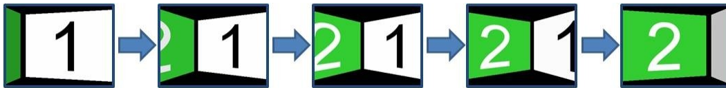
Figure 12: Sample prism transition 2

The following figure is a sample with dir equal to "r" (right), isContent equal to false , isInverted equal to true :