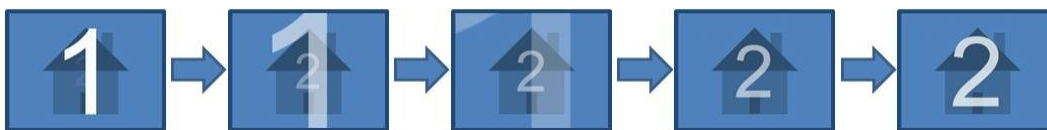
Figure 6: Sample flythrough transition

The following figure is a sample with dir equal to "in", hasBounce equal to false :