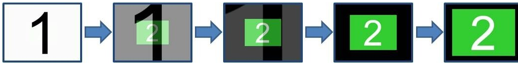
Figure 19: Sample warp transition

The following W3C XML Schema ( [XMLSCHEMA1] section 2.1) fragment specifies the contents of this element.