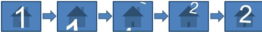
Figure 3: Sample ferris transition

The following is a sample with dir equal to "l" (left):