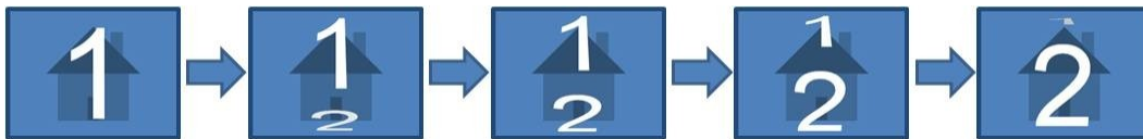
Figure 13: Sample prism transition 3

The following figure is a sample with dir equal to "u" (up), isContent equal to true , isInverted equal to false :