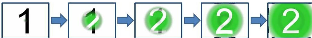
Figure 15: Sample ripple transition

The following figure is a sample with dir equal to "center".