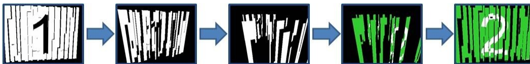
Figure 16: Sample shred transition

The following figure is a sample with pattern equal to "strip", dir equal to "in":