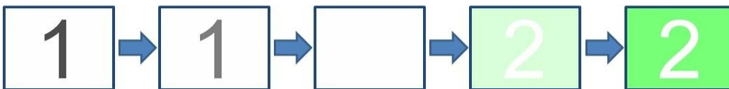
Figure 4: Sample flash transition