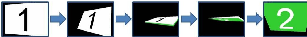
Figure 5: Sample flip transition

The following figure is a sample with dir equal to "r" (right).