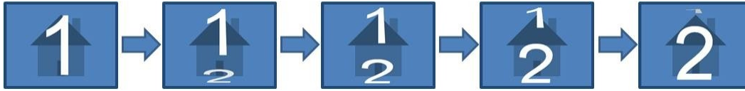
Figure 8: Sample prism transition 3

The following figure is a sample with dir equal to "u" (up), isContent equal to true , isInverted equal to false :