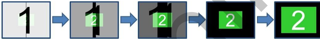
Figure 9: Sample doors transition

The following is a sample with dir equal to "vert" (vertical):