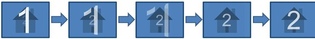
Figure 10: Sample window transition

The following W3C XML Schema ( [XMLSCHEMA1] section 2.1) fragment specifies the contents of this element.