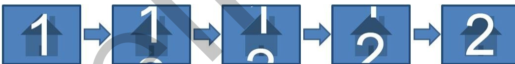
Figure 14: Sample pan transition

The following figure is a sample with dir equal to "u" (up).