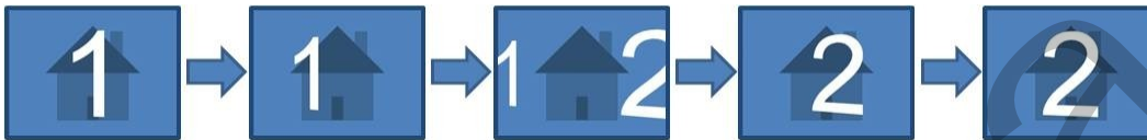
Figure 13: Sample conveyor transition

The following is a sample with dir equal to "l" (left):