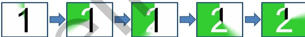
Figure 21: Sample wheelReverse transition

The following figure is a sample with spokes equal to 1.