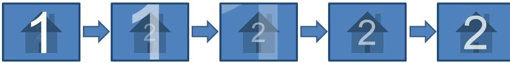
Figure 17: Sample flythrough transition

The following W3C XML Schema ( [XMLSCHEMA1] section 2.1) fragment specifies the contents of this element.