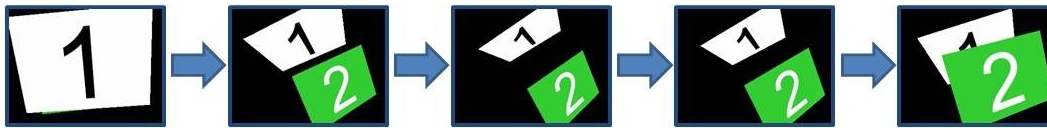
Figure 2: Sample switch transition

The following W3C XML Schema ( [XMLSCHEMA1] section 2.1) fragment specifies the contents of this element.