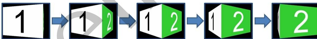
Figure 6: Sample prism transition 1

The following figure is a sample with dir equal to "l" (left), isContent equal to false , isInverted equal to false :