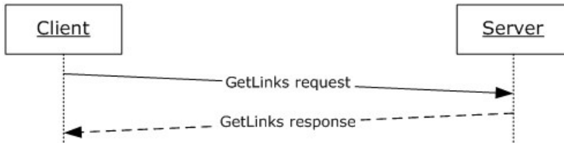
Figure 2: High-level sequence diagram for Published Links Web Service Protocol

The protocol client sends a GetLinksSoapIn request message and the protocol server MUST respond with a GetLinksSoapOut response message.