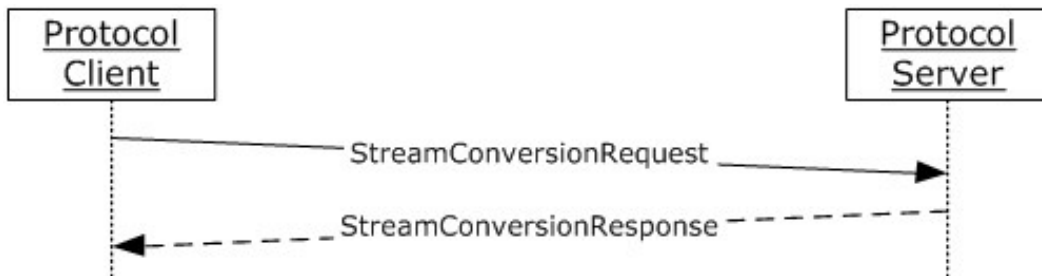
Figure 2: Sample communication between protocol client and protocol server

The following diagram describes the communication between the protocol client and the protocol server.