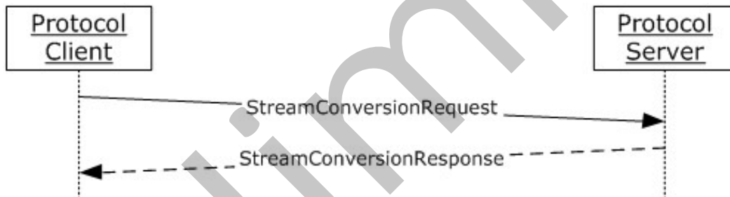
Figure 2: Sample communication between protocol client and protocol server

The following diagram describes the communication between the protocol client and the protocol server.