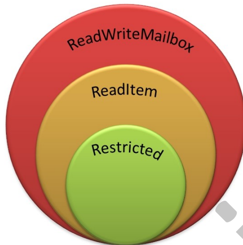
Figure 3: Relationship between capabilities

The following diagram shows the relationship between capabilities: