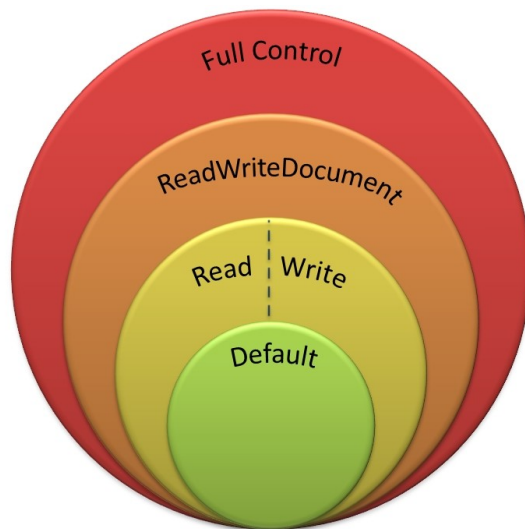
Figure 2: Relationship between capabilities

The outer capabilities aggregate the inner capabilities. Note that ReadDocument and WriteDocument (abbreviated in the preceding diagram and defined in the following table) are exclusive: both include the Default capability and are then aggregated in the ReadWriteDocument capability.