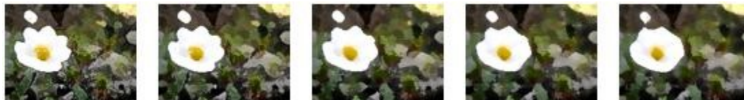
Figure 17: Effect of changes to brushSize

The following figure demonstrates the effect applied to a picture with brushSize values of zero, 2, 5, 7, and 10, respectively.