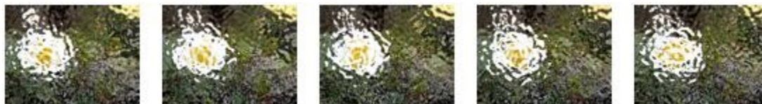
Figure 10: Effect of changes to scaling

The following figure demonstrates the effect applied to a picture with scaling values of zero, 25, 50, 75, and 100, respectively.