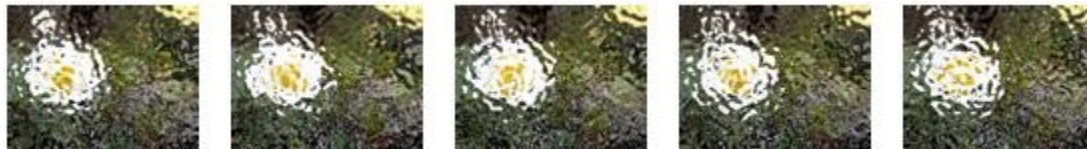
Figure 10: Effect of changes to scaling

The following figure demonstrates the effect applied to a picture with scaling values of zero, 25, 50, 75, and 100, respectively.