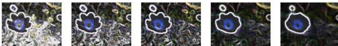
Figure 12: Effect of changes to smoothness

The following figure demonstrates the effect applied to a picture with smoothness values of zero, 2, 5, 7, and 10, respectively.