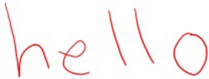
Figure 31: Sample ink shape

The following code example represents the Ink content part that describes the example ink shown in the preceding figure. The brush definitions specify its size, shape, color, and coordinate space. Traces are gathered into a traceGroup hierarchy of writingRegion , paragraph , line , and inkWord , with the inkWord containing the results of ink recognition that was generated at runtime.