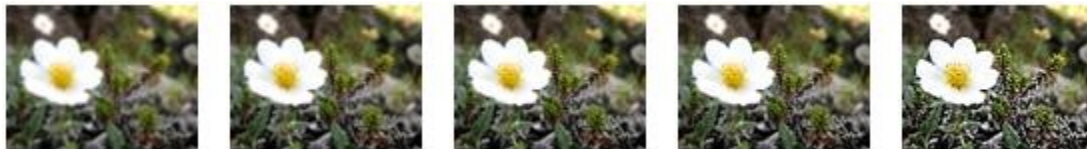
Figure 25: Effect of changes to sharpenSoften

The following figure demonstrates the effect applied to a picture with sharpenSoften values of -100 percent, -50 percent, zero percent, +50 percent, and +100 percent, respectively.