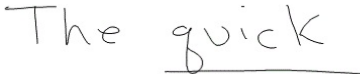
Figure 30: Example ink text

For example, the following figure shows ink that is analyzed as shown in the following code example.