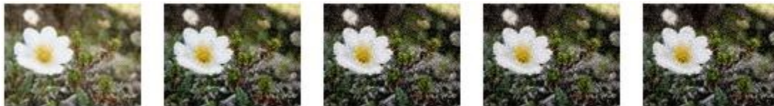
Figure 16: Effect of changes to pressure

The following figure demonstrates the effect applied to a picture with pressure values of zero, 25, 50, 75, and 100, respectively.