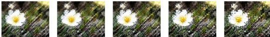
Figure 19: Effect of changes to scaling

The following figure demonstrates the effect applied to a picture with scaling values of zero, 25, 50, 75, and 100, respectively.