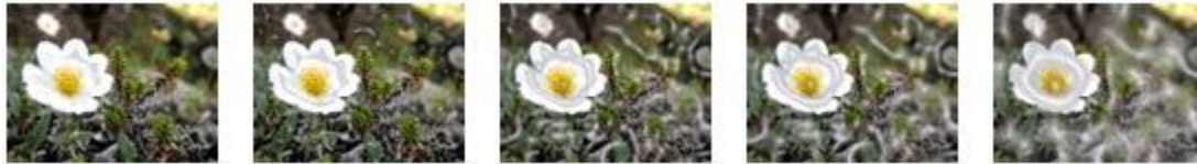
Figure 23: Effect of changes to smoothness

The following figure demonstrates the effect applied to a picture with smoothness values of zero, 2, 5, 7, and 10, respectively.