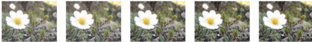
Figure 7: Effect of changes to pressure