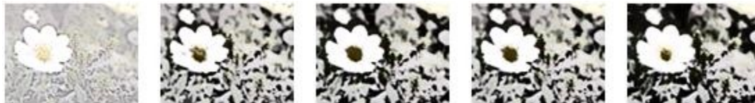
Figure 22: Effect of changes to detail

The following figure demonstrates the effect applied to a picture with detail values of zero, 2, 5, 7, and 10, respectively.