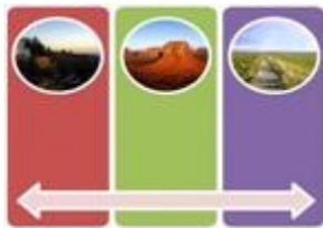
Figure 28: recolorImg is set to "false" or not present

The following figures demonstrate the effect of this flag on a diagram with images in it.