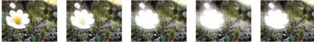
Figure 11: Effect of changes to intensity

The following figure demonstrates the effect applied to a picture with intensity values of zero, 2, 5, 7, and 10, respectively.