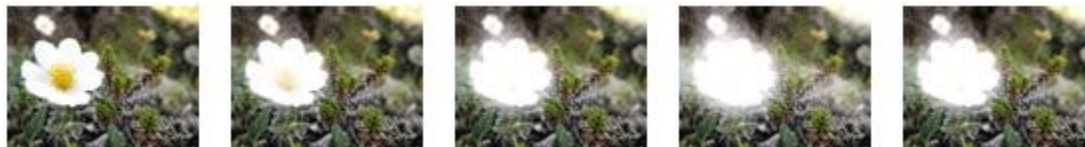
Figure 11: Effect of changes to intensity

The following figure demonstrates the effect applied to a picture with intensity values of zero, 2, 5, 7, and 10, respectively.