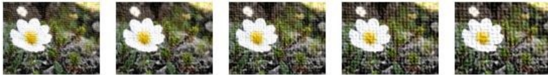
Figure 26: Effect of changes to scaling