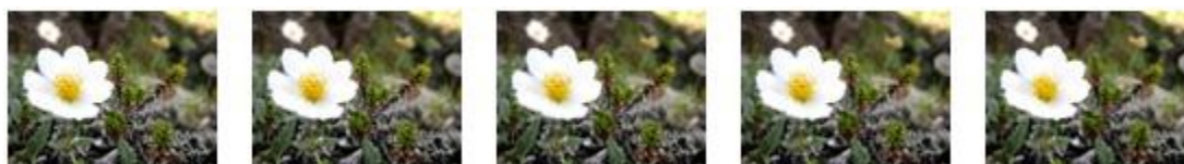
Figure 15: Effect of changes to size

The following figure demonstrates the effect applied to a picture with size values of zero, 25, 50, 75, and 100, respectively.