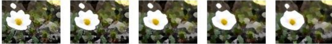
Figure 17: Effect of changes to brushSize

The following figure demonstrates the effect applied to a picture with brushSize values of zero, 2, 5, 7, and 10, respectively.