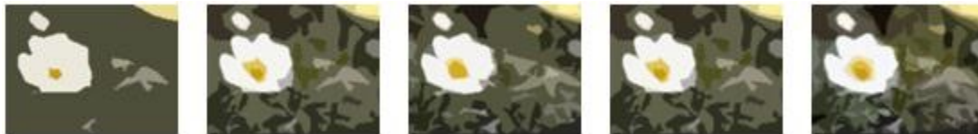
Figure 8: Effect of changes to numberOfShades

The following figure demonstrates the effect applied to a picture with numberOfShades values of zero, 2, 3, 4, and 6, respectively.