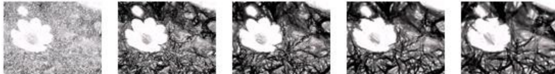
Figure 20: Effect of changes to pencilSize

The following figure demonstrates the effect applied to a picture with pencilSize values of zero, 25, 50, 75, and 100, respectively.