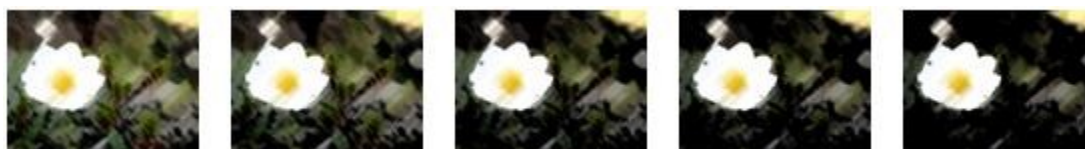
Figure 18: Effect of changes to intensity

The following figure demonstrates the effect applied to a picture with intensity values of zero, 2, 5, 7, and 10, respectively.