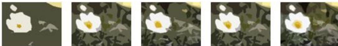
Figure 8: Effect of changes to numberOfShades

The following figure demonstrates the effect applied to a picture with numberOfShades values of zero, 2, 3, 4, and 6, respectively.