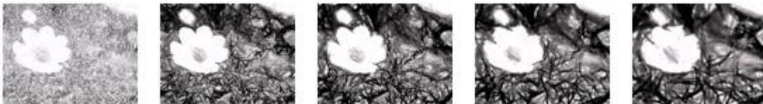
Figure 20: Effect of changes to pencilSize

The following figure demonstrates the effect applied to a picture with pencilSize values of zero, 25, 50, 75, and 100, respectively.