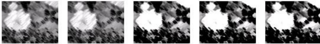
Figure 5: Effect of changes to pressure

The following figure demonstrates the effect applied to a picture with pressure values of zero, 1, 2, 3, and 4 respectively.