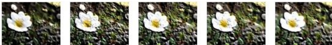
Figure 4: Effect of changes to crackSpacing

The following figure demonstrates the effect applied to a picture with crackSpacing values of zero, 25, 50, 75, and 100, respectively.