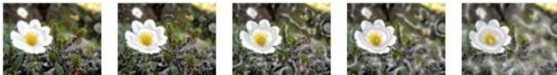
Figure 23: Effect of changes to smoothness

The following figure demonstrates the effect applied to a picture with smoothness values of zero, 2, 7, and 10, respectively.