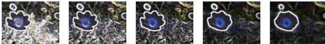
Figure 12: Effect of changes to smoothness

The following figure demonstrates the effect applied to a picture with smoothness values of zero, 2, 5, 7, and 10, respectively.