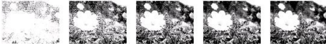
Figure 21: Effect of changes to pressure

The following figure demonstrates the effect applied to a picture with pressure values of zero, 25, 50, 75, and 100, respectively.