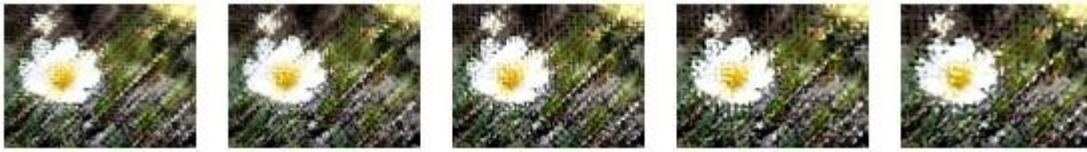
Figure 19: Effect of changes to scaling