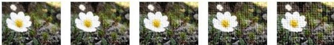
Figure 26: Effect of changes to scaling

The following figure demonstrates the effect applied to a picture with scaling values of zero, 25, 50, 75, and 100, respectively.