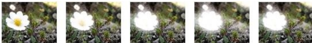
Figure 11: Effect of changes to intensity

The following figure demonstrates the effect applied to a picture with intensity values of zero, 2, 5, 7, and 10, respectively.