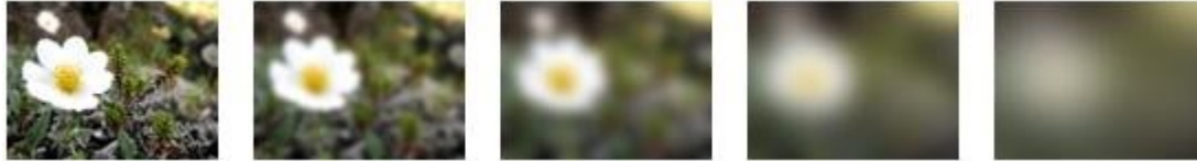
Figure 1: Effect of changes to blur radius

The following figure demonstrates the effect applied to a picture with radius values of zero, 5, 10, 20, and 40, respectively.