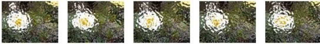
Figure 10: Effect of changes to scaling