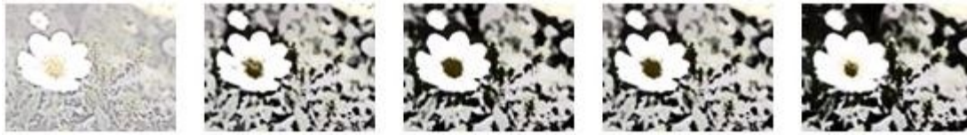
Figure 22: Effect of changes to detail