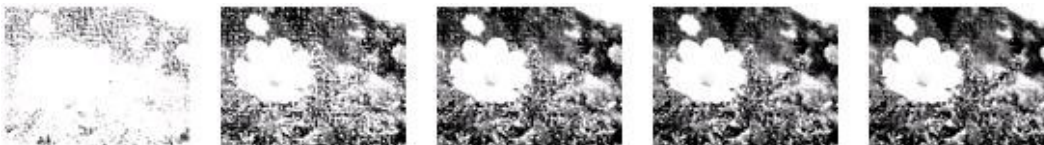
Figure 21: Effect of changes to pressure

The following figure demonstrates the effect applied to a picture with pressure values of zero, 25, 50, 75, and 100, respectively.