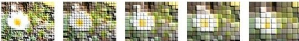
Figure 13: Effect of changes to gridSize

The following figure demonstrates the effect applied to a picture with gridSize values of zero, 2, 5, 7, and 10, respectively.