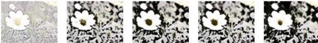
Figure 22: Effect of changes to detail

The following figure demonstrates the effect applied to a picture with detail values of zero, 2, 5, 7, and 10, respectively.