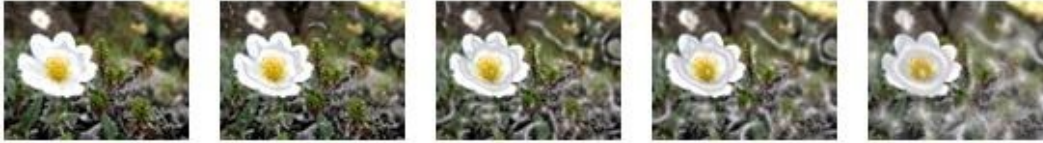
Figure 23: Effect of changes to smoothness

The following figure demonstrates the effect applied to a picture with smoothness values of zero, 2, 5, 7, and 10, respectively.