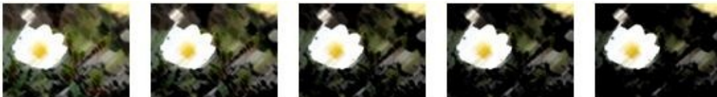
Figure 18: Effect of changes to intensity

The following figure demonstrates the effect applied to a picture with intensity values of zero, 2, 5, 7, and 10, respectively.