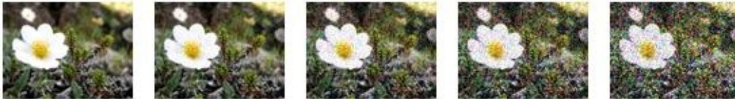
Figure 9: Effect of changes to grainSize

The following figure demonstrates the effect applied to a picture with grainSize values of zero, 25, 50, 75, and 100, respectively.