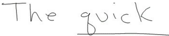
Figure 30: Example ink text

For example, the following figure shows ink that is analyzed as shown in the following code example.