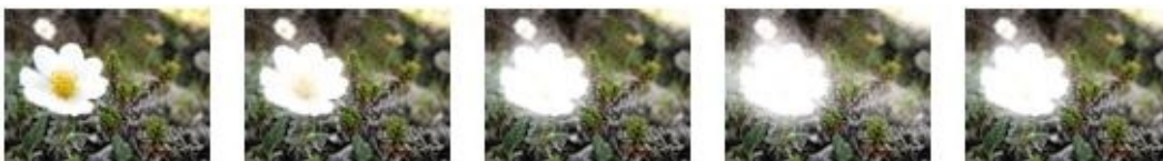
Figure 11: Effect of changes to intensity

The following figure demonstrates the effect applied to a picture with intensity values of zero, 2, 5, 7, and 10, respectively.