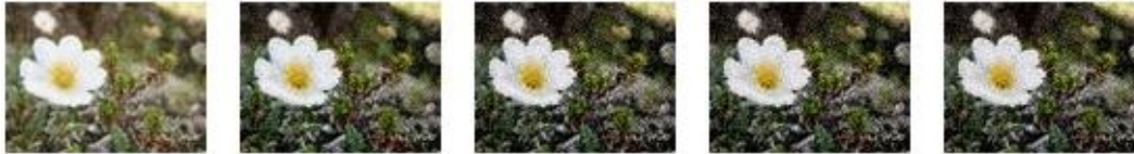
Figure 16: Effect of changes to pressure

The following figure demonstrates the effect applied to a picture with pressure values of zero, 25, 50, 75, and 100, respectively.