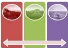
Figure 29: recolorImg is set to "true"

The following W3C XML Schema ( [XMLSCHEMA1] section 2.1) fragment specifies the contents of this element.