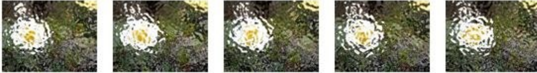
Figure 10: Effect of changes to scaling

The following figure demonstrates the effect applied to a picture with scaling values of zero, 25, 50, 75, and 100, respectively.