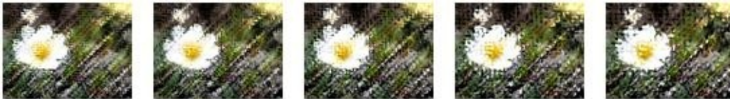
Figure 19: Effect of changes to scaling

The following figure demonstrates the effect applied to a picture with scaling values of zero, 25, 50, 75, and 100, respectively.