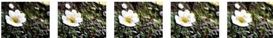
Figure 4: Effect of changes to crackSpacing

The following figure demonstrates the effect applied to a picture with crackSpacing values of zero, 25, 50, 75, and 100, respectively.