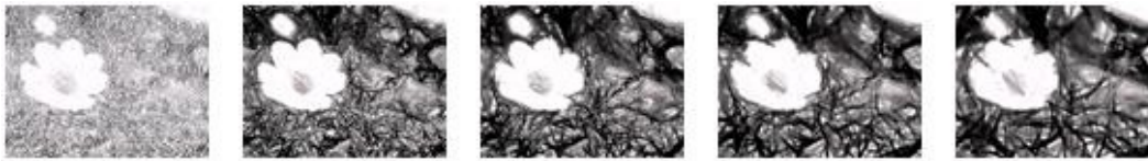
Figure 20: Effect of changes to pencilSize

The following figure demonstrates the effect applied to a picture with pencilSize values of zero, 25, 50, 75, and 100, respectively.