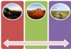
Figure 28: recolorImg is set to "false" or not present

The following figures demonstrate the effect of this flag on a diagram with images in it.