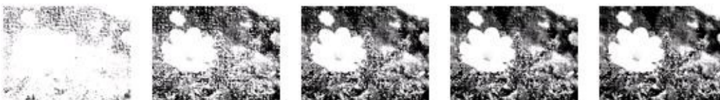
Figure 21: Effect of changes to pressure

The following figure demonstrates the effect applied to a picture with pressure values of zero, 25, 50, 75, and 100, respectively.