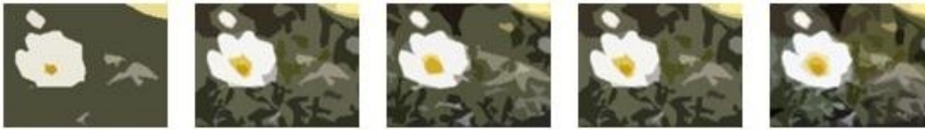
Figure 8: Effect of changes to numberOfShades

The following figure demonstrates the effect applied to a picture with numberOfShades values of zero, 2, 3, 4, and 6, respectively.