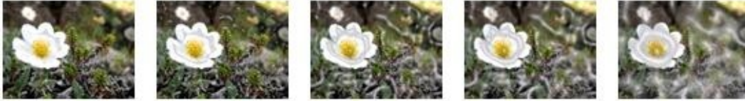
Figure 23: Effect of changes to smoothness

The following figure demonstrates the effect applied to a picture with smoothness values of zero, 2, 5, 7, and 10, respectively.