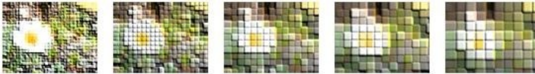
Figure 13: Effect of changes to gridSize

The following figure demonstrates the effect applied to a picture with gridSize values of zero, 2, 5, 7, and 10, respectively.