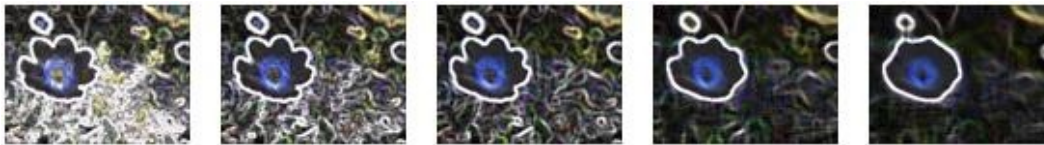
Figure 12: Effect of changes to smoothness

The following figure demonstrates the effect applied to a picture with smoothness values of zero, 2, 5, 7, and 10, respectively.