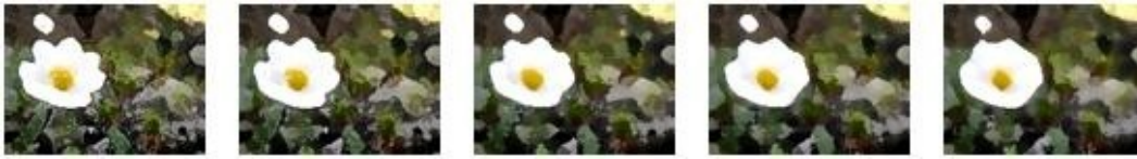
Figure 17: Effect of changes to brushSize