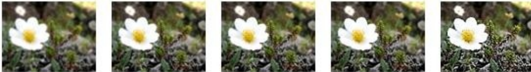
Figure 25: Effect of changes to sharpenSoften

The following figure demonstrates the effect applied to a picture with sharpenSoften values of –100 percent, –50 percent, zero percent, +50 percent, and +100 percent, respectively.