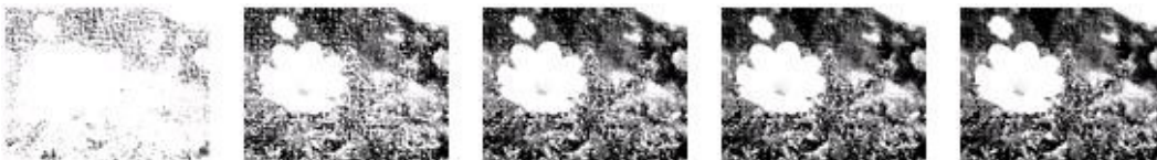
Figure 21: Effect of changes to pressure

The following figure demonstrates the effect applied to a picture with pressure values of zero, 25, 50, 75, and 100, respectively.