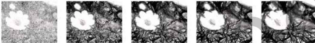
Figure 19: Effect of changes to pencilSize

The following figure demonstrates the effect applied to a picture with pencilSize values of zero, 25, 50, 75, and 100, respectively.