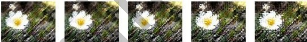
Figure 18: Effect of changes to scaling

The following figure demonstrates the effect applied to a picture with scaling values of zero, 25, 50, 75, and 100, respectively.