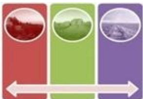
Figure 2: recolorImg is set to "true"

The following W3C XML Schema ( [XMLSCHEMA1] section 2.1) fragment specifies the contents of this element.