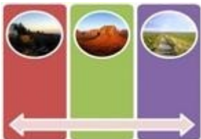
Figure 1: recolorImg is set to "false" or not present

The following figures demonstrate the effect of this flag on a diagram with images in it.