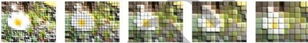
Figure 12: Effect of changes to gridSize

The following figure demonstrates the effect applied to a picture with gridSize values of zero, 2, 5, 7, and 10, respectively.