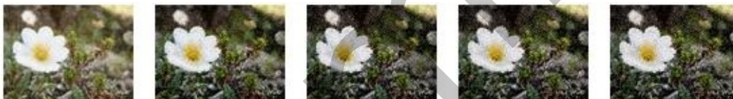
Figure 15: Effect of changes to pressure

The following figure demonstrates the effect applied to a picture with pressure values of zero, 25, 50, 75, and 100, respectively.