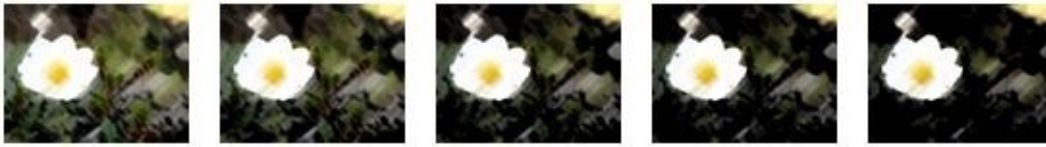
Figure 17: Effect of changes to intensity