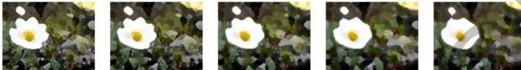
Figure 16: Effect of changes to brushSize

The following figure demonstrates the effect applied to a picture with brushSize values of zero, 2, 5, 7, and 10, respectively.