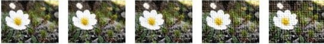
Figure 23: Effect of changes to scaling

The following figure demonstrates the effect applied to a picture with scaling values of zero, 25, 50, 75, and 100, respectively.