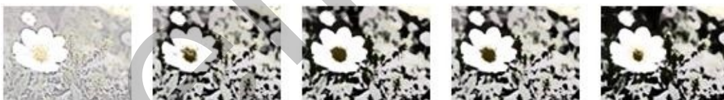
Figure 21: Effect of changes to detail

The following figure demonstrates the effect applied to a picture with detail values of zero, 2, 5, 7, and 10, respectively.