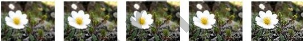
Figure 29: Effect of changes to sharpenSoften

The following figure demonstrates the effect applied to a picture with sharpenSoften values of -100 percent, -50 percent, zero percent, +50 percent, and +100 percent, respectively.