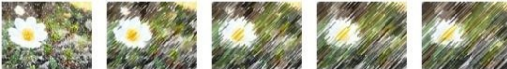
Figure 13: Effect of changes to pencilSize

The following figure demonstrates the effect applied to a picture with pencilSize values of zero, 25, 50, 75, and 100, respectively.