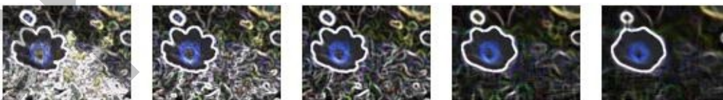
Figure 11: Effect of changes to smoothness

The following figure demonstrates the effect applied to a picture with smoothness values of zero, 2, 5, 7, and 10, respectively.