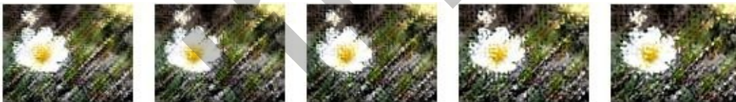
Figure 17: Effect of changes to scaling

The following figure demonstrates the effect applied to a picture with scaling values of zero, 25, 50, 75, and 100, respectively.