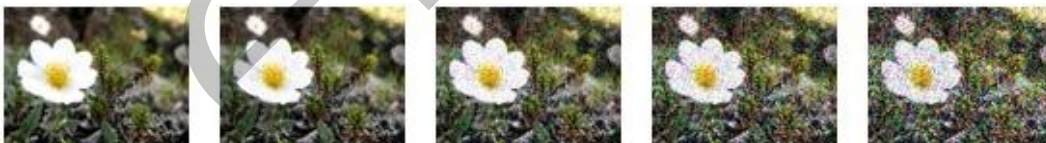
Figure 8: Effect of changes to grainSize

The following figure demonstrates the effect applied to a picture with grainSize values of zero, 25, 50, 75, and 100, respectively.