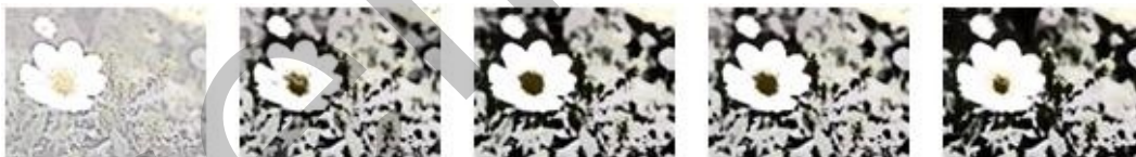
Figure 20: Effect of changes to detail

The following figure demonstrates the effect applied to a picture with detail values of zero, 2, 5, 7, and 10, respectively.