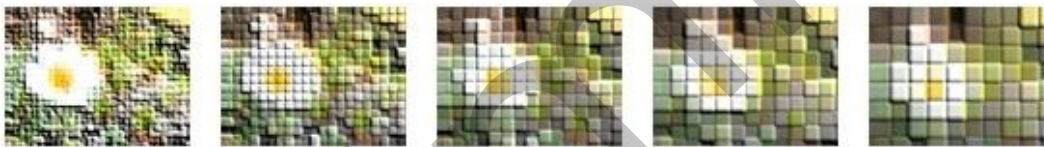
Figure 12: Effect of changes to gridSize

The following figure demonstrates the effect applied to a picture with gridSize values of zero, 2, 5, 7, and 10, respectively.