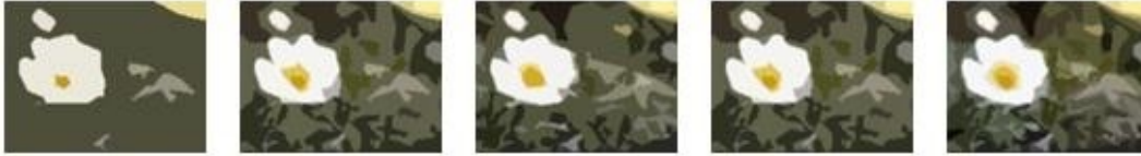
Figure 7: Effect of changes to numberOfShades

The following figure demonstrates the effect applied to a picture with numberOfShades values of zero, 2, 3, 4, and 6, respectively.