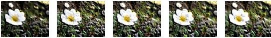
Figure 4: Effect of changes to crackSpacing