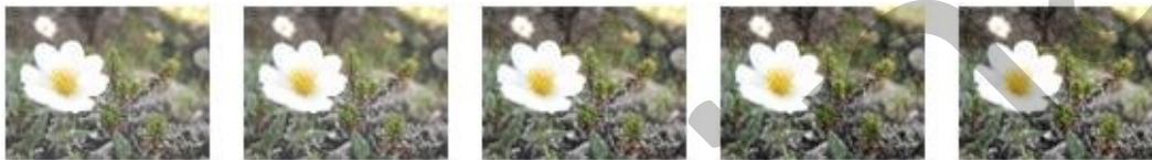
Figure 6: Effect of changes to pressure

The following figure demonstrates the effect applied to a picture with pressure values of zero, 25, 50, 75, and 100, respectively.