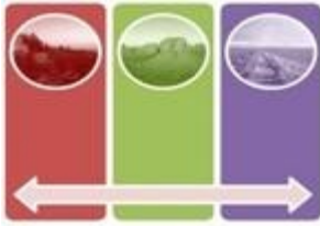
Figure 2: recolorImg is set to "true"

The following W3C XML Schema ( [XMLSCHEMA1] section 2.1) fragment specifies the contents of this element.