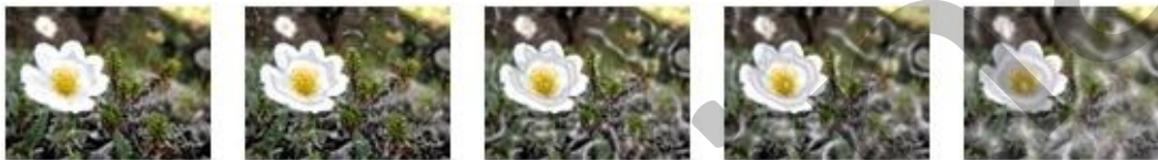
Figure 21: Effect of changes to smoothness

The following figure demonstrates the effect applied to a picture with smoothness values of zero, 2, 5, 7, and 10, respectively.