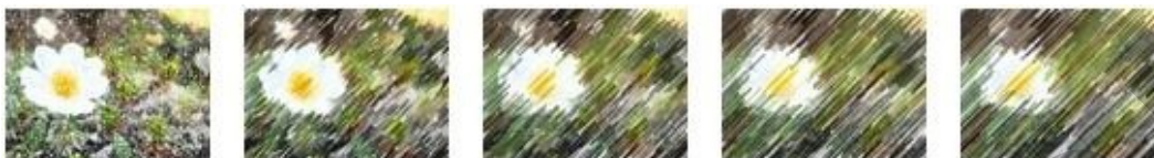
Figure 13: Effect of changes to pencilSize

The following figure demonstrates the effect applied to a picture with pencilSize values of zero, 25, 50, 75, and 100, respectively.