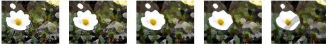
Figure 16: Effect of changes to brushSize

The following figure demonstrates the effect applied to a picture with brushSize values of zero, 2, 5, 7, and 10, respectively.