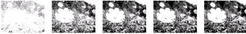
Figure 19: Effect of changes to pressure

The following figure demonstrates the effect applied to a picture with pressure values of zero, 25, 50, 75, and 100, respectively.