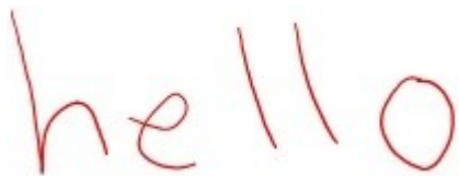
Figure 30: Sample ink shape

The following code example represents the Ink content part that describes the example ink shown in the preceding figure. The brush definitions specify its size, shape, color, and coordinate space. Traces are gathered into a traceGroup hierarchy of writingRegion , paragraph , line , and inkWord , with the inkWord containing the results of ink recognition that was generated at runtime.