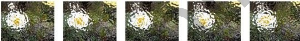
Figure 9: Effect of changes to scaling

The following figure demonstrates the effect applied to a picture with scaling values of zero, 25, 50, 75, and 100, respectively.