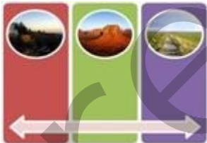
Figure 1: recolorImg is set to "false" or not present

The following figures demonstrate the effect of this flag on a diagram with images in it.