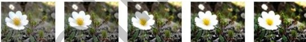
Figure 25: Effect of changes to contrast

The following figure demonstrates the effect applied to a picture with contrast values of -40 percent, -20 percent, zero percent, +20 percent, and +40 percent, respectively.