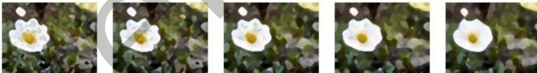
Figure 23: Effect of changes to brushSize

The following figure demonstrates the effect applied to a picture with brushSize values of zero, 2, 5, 7, and 10, respectively.