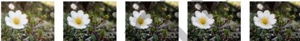
Figure 15: Effect of changes to pressure

The following figure demonstrates the effect applied to a picture with pressure values of zero, 25, 50, 75, and 100, respectively.